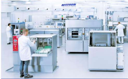
Machine Test Center