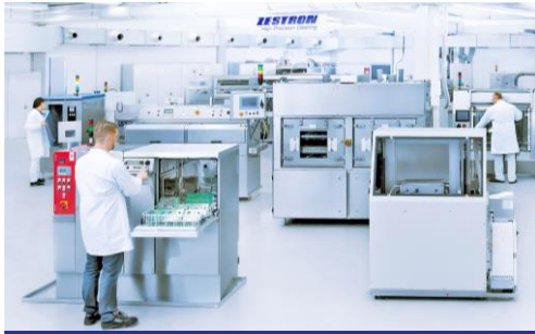
Machine Test Center