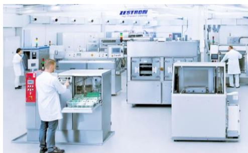
Machine Test Center